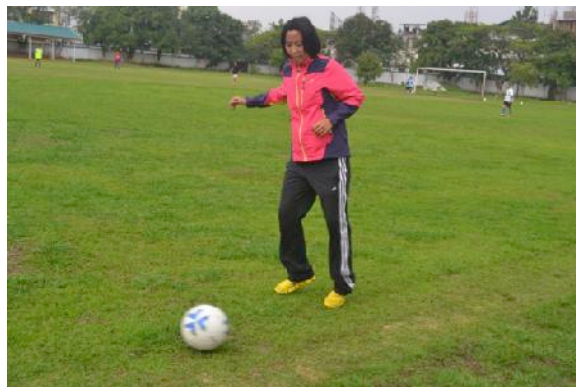
Figure 7 – Ngangom Bala Devi

She also represented the India women's under-19 side in 2006 and 2007. She was then made a part of the India team that took part in the first women's SAFF Championship in 2010. Bala claims that her best sporting moments came in the SAFF championships in the years 2010 as well as in 2014. In the 2014 sports edition, she ended up scoring more than 16 goals in just five matches. Devi managed to find the net four times in the final as India defeated Nepal 6–0 to claim their third straight SAFF Championship crown. Due to her performance in the tournament, Devi was awarded the Women's Player of the Year for 2014 by the All India Football Federation. Reflecting on the award, Devi says that she felt proud to win it as a woman. She hopes that it would be an inspiration for more and more girls take up the sport as the girls have a better chance for qualifying for the World Cup than boys!