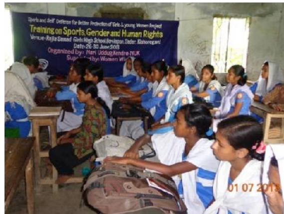
Figure 2 – NUK Training on Sports Gender and Human Rights

NUK initiated these project in 2008, funded by Women Win thus equip women and young girls with self-security skill (karate training), challenging and changing gender stereotypes and discrimination in sports which are considered to be the only for males and not suitable for activities for women to undertake in public spaces. The program encourages