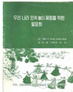
Presentation in 1985 to select traditional activities of Korea