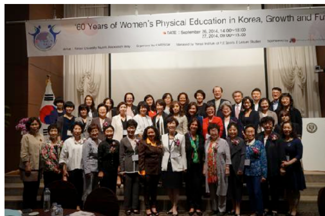
Figure 1 – International Conference Celebrating 60th Anniversary of KAPESGW in 2014 (Yonsei University, Seoul)

So far, KAPESGW has established many regional branches to expand grounds for female athletes, and contributed in educating and cultivating female sports leaders. Moreover, it has been actively involved in international and domestic PE exchanges by