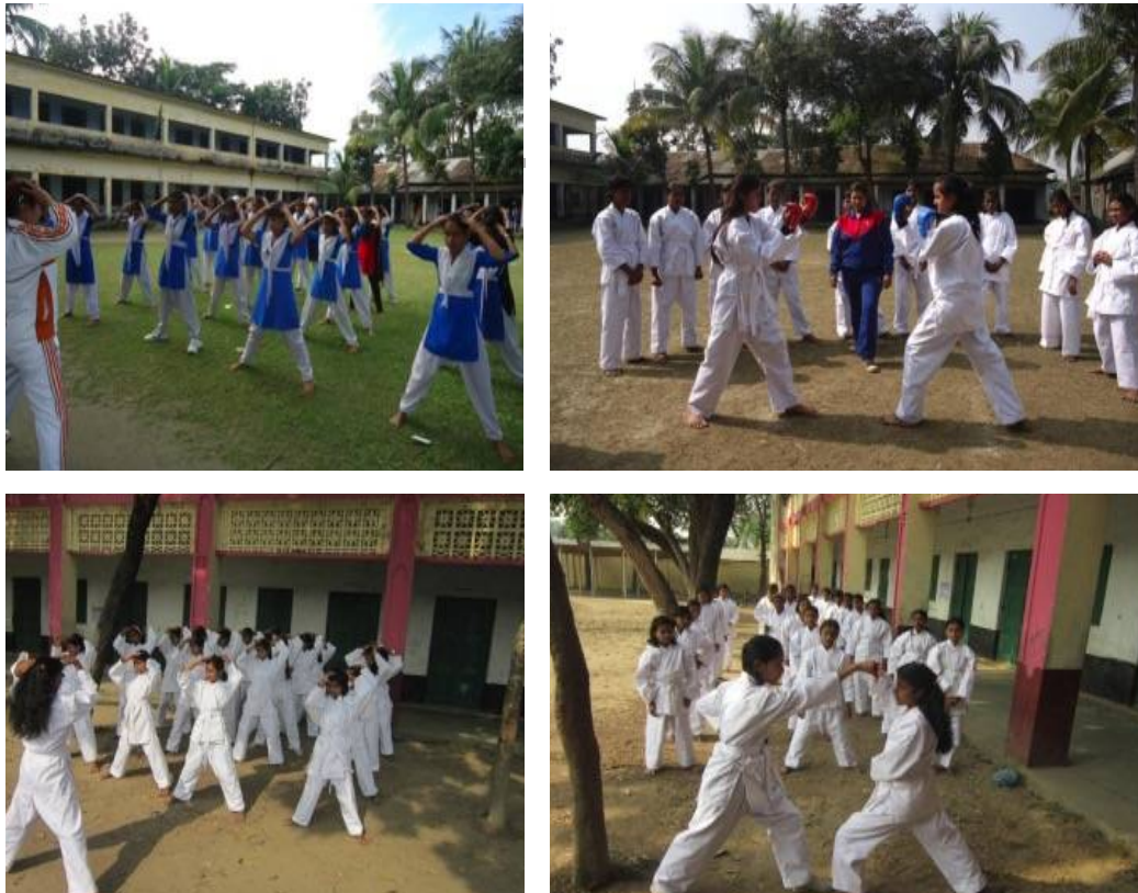
Figure 3 – Picture of Karate Coaching in different schools in Kishorgonj

The activities and efforts of NUK's Initiatives to reduce the gender stereotypes in sports; introduction of self-defence skills – KARATE as a tool to defending violence against women; enhancing and encouraging outdoor sports among female students of secondary schools and community girls; capacity building of physical education instructors; increasing