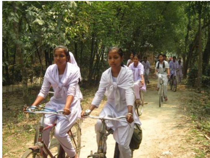
Figure 4 – Girls from the Project of Bicycle for Girls Empowerment

Historically the bicycle helped empower women by giving them mobility and autonomy, and breaking down the social barriers. In the rural Bangladesh girls must walk in an average of 3-5 kilometres to school. Girls face daily intimidation, cat-calls, rape and other forms verbal, sexual and physical abuses, harassment and even the risks of kidnapping and trafficking on their way to schools. As a result, many girls drop out from school because of the risk of walking the long distance from their home. These lead many girls to the risk of child marriage, dowry, teenage pregnancy, domestic violence and other social problems. The project is therefore, expected to reduce the risk of everyday harassment walking to and from school. Culturally riding bicycles is considered a male form of transportation. For social and economic reasons very few girls ride bicycle. Lack