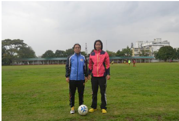
Figure 4 – Bembem Devi and Bala Devi - the two legends of Indian women football

In the long list of football legends that have been produced by Manipur, Oimam Bembem Devi and Nganong Bala Devi are two of the most prominent names of Indian football. Facing a myriad challenges on their way to national and international glory, the two women have opened new doors for the women of Manipur through their sporting glory. Their inspirational struggles set at the backdrop of the volatile political atmosphere of Manipur are important ones and can be used to initiate a renewed dialogue for the empowerment of women. It provides the means to address the sexist and racist constraints faced regularly by women from minority communities within the country.