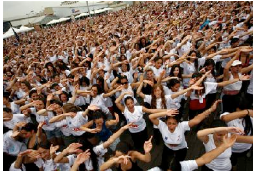
Figure 1 – Photo of ATHENA project

The National Council for the Advancement of Girls and Women in Sports acts under Israeli Government Resolution 3416, dated 21.3.2005. Its vision is to change Israel's sport culture, both socially and in respect to "gender thinking", in order to ensure the full participation of girls and women in all fields of sports and at all levels.