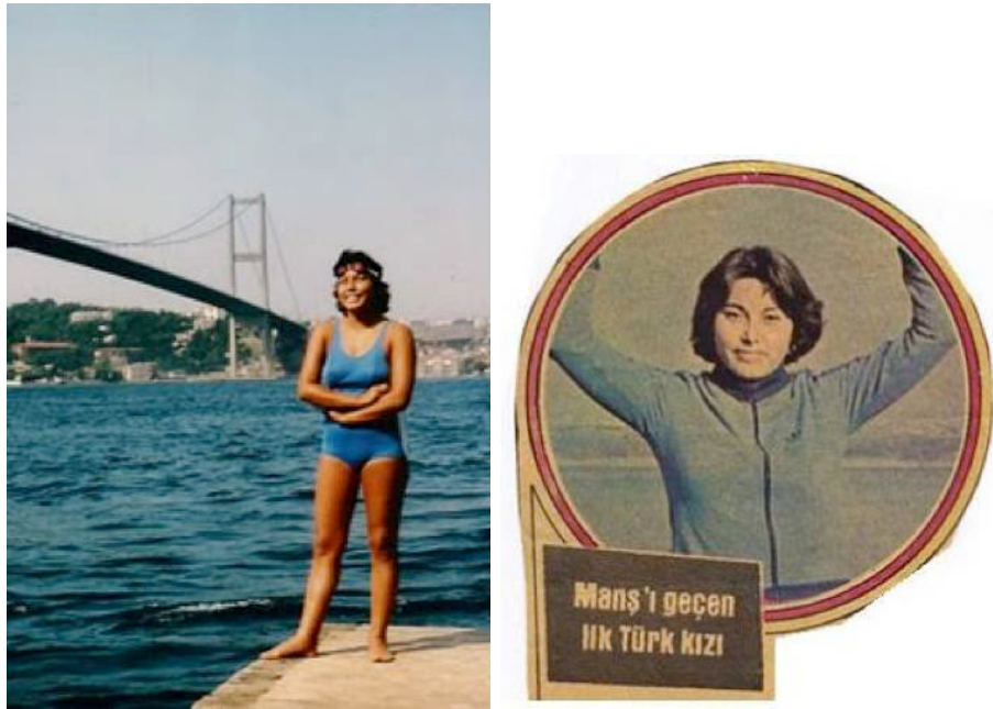
Figure 1 – Photos from a Turkish daily news (Written: Turkish girl who has passed Manche)

My mother does not tell the event; but she is as if experiencing it again and again: "Against a huge giant, you have no weapon other than your willpower [...] Each stroke in the cold, distant and dark water of the English Channel was a blow that I did to the giant, but I was consumed away, as well. Can you imagine? 40 thousand meters, 80 thousand strokes! A person cannot even repeat the same word for 80 thousand times at once while sitting in an armchair. However, I stroke out for 180 thousand times. I was not hungry... I was not thirsty [...] But, I was tired. Time was the only thing that I wondered. [...] Forgetting that I was in the middle of a sea, I was just wondering time. Where was I of the time, when did I begin and when would it finish? This was the only question in my mind. I could not even believe that I came to the shores of France. Besides, in this sea, which is described as "The English Channel Hell". as I went adrift, instead of 40 thousand meters, I swam for 50 thousand meters. 100 thousand strokes. The time spent: 15 hours and 47 minutes[...]"