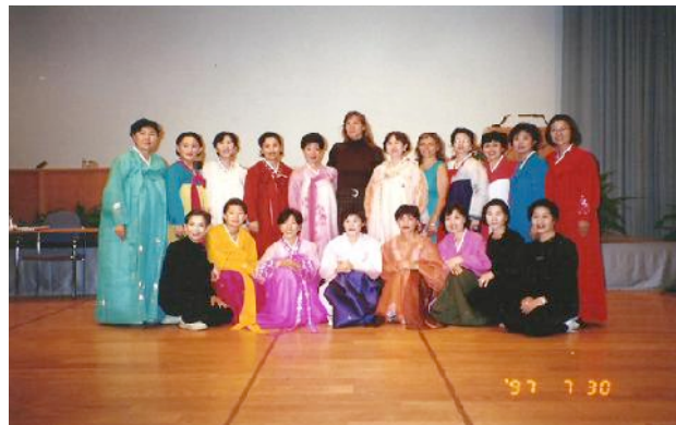
Figure 3 – After demonstrating the Ganggangsulae at 1997 World Congress of IAPESGW