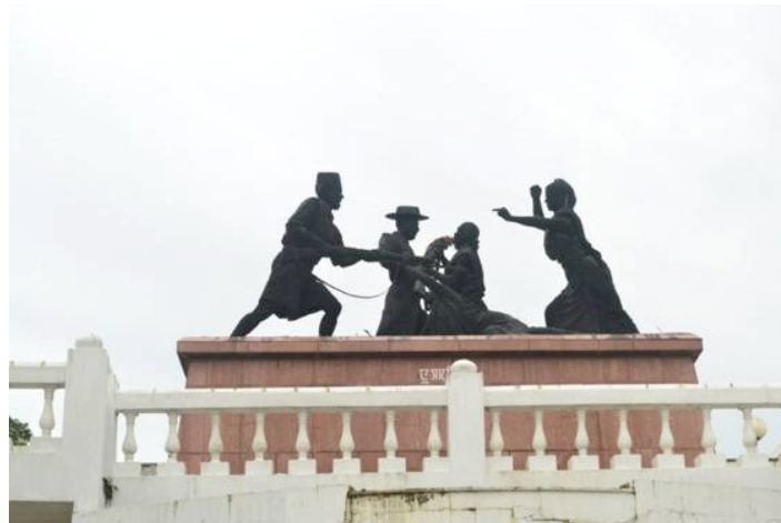
Figure 3 – The Nupi-Lan memorial at Imphal

Even in contemporary times there is many an image of Manipuri women who have been at the forefront of Manipuri political and social life. Irom Chamu Sharmila has been fasting to death since 14 years against AFSPA and is currently on trial for attempted suicide while spending most of her time in the hospital force-fed ( http://www.e-pao.net ).