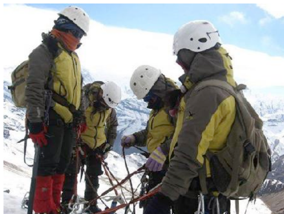
Figure 2 – Four Annapura Expedition Trainees

The GOAL programme started in 2013. It is an outreach programme in local government schools for under-privileged children. The programme is designed to empower and educate young girls on pressing issues that affect their lives, for example, leadership, discrimination, violence against women, sexual health, trafficking and other pertinent social topics. Girls from ages 12-17 participate in this project for a total of nine months. A 1-hour session on life skills is typically followed by one hour of sports, e.g. badminton, netball and volleyball.