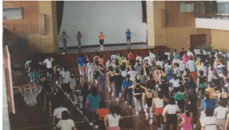
Figure 4 – 1987 National Physical Education Dance Instructor Aerobics Class

KAPESGW has established the ground for aerobics exercise in Korea. Aerobics exercise was first introduced in Korea by KAPESGW at Ewha Womans University gymnasium during the national summer classes for PE dance instructors in August 1975. However, I had to endure a severely painful process to demonstrate intense movements consecutively in early aerobics classes at