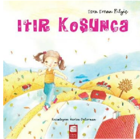
Figure 3 – Cover of the book “When Itir Runs” (In Turkish; Itir Koşunca)

For Itir Erhart, “That protagonist’s being a girl is wonderful. While the “curious”, “creative” boys are playing outside and building something with their fathers, the “lovely” girls are making a cake at home with their mothers. While the adjectives such as “brave”, “hero”, “lion” and “master” are attributed to the boys, the girls are referred to as “my dear”, “my sea bream”, “my hennaed lamb” and “my princess”.” In this book, however, there is a girl who is now outside the house and manages to make the whole village step into action. In the book, this small girls calls all the children to start out to change the world: