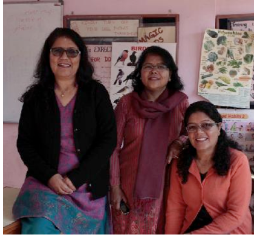
Figure 1 – 3 Sisters

3 Sisters Adventure is one of the few women-owned trekking companies in Nepal and EWN has trained nearly 1000 disadvantaged, rural women to become trekking guides and assistants. It is the only trekking company in Nepal that provides a platform for rural, disadvantaged women who have few opportunities to develop their knowledge, learn and use their skills to earn an income to support themselves and their families, to travel to new places outside their isolated villages, to meet and communicate with other Nepalese women and share their stories, and interact with foreigners from all over the world.