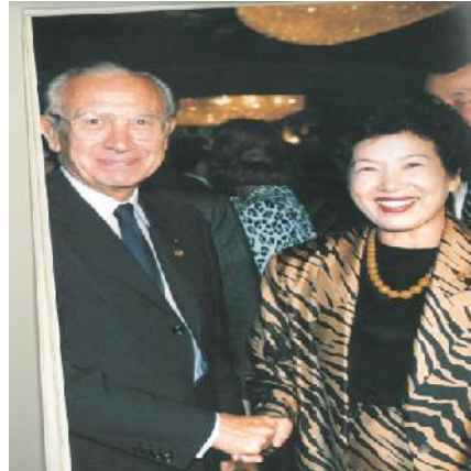
Figure 6 – With Juan Samaranch, the former president of IOC

She cultivated many female sports leaders during her life, and has left many tasks for them. Her dreams were achieved one after another to produce Olympic champions and world stars in female archery and skating, and flowers of sports for all have been blooming in competition with sports-advanced countries such as the U.S, Japan and Europe. I assume that her soul in the heaven must be forever content and pleased (Source: May 2014 Sports Forum 21 Special <Exploration of Important Figures 1>).