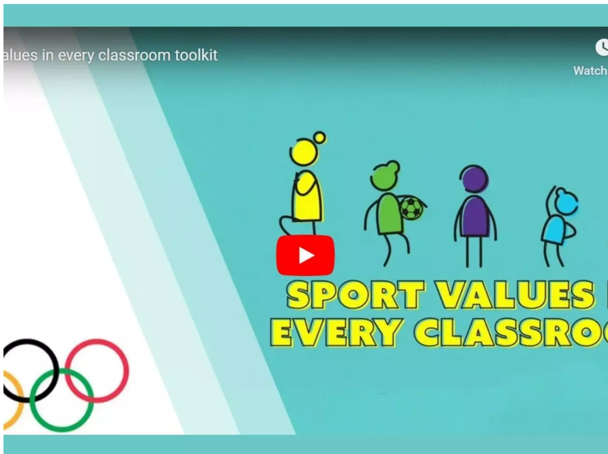
IOC - Sport Values In Every Classroom