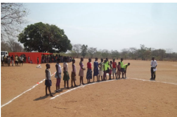
Opportunities for girls in the sports programmes of the Malawi National Council of Sport.

I was at the time working for the Department of Income Tax in Malawi as a temporary Tax Inspector, in the Ministry of Finance. Chances of me getting a good permanent job in the department were very good as I had a good Economics Degree. However, because my heart was in sport, I eventually moved and joined the Malawi National Council of Sport, in 2000 as a Sport Development Officer. I am still working with the Council but now as a Sport Development Manager and I am the only lady member of management team. One of my key responsibilities is to drive the development and promotion of women sport in the country.