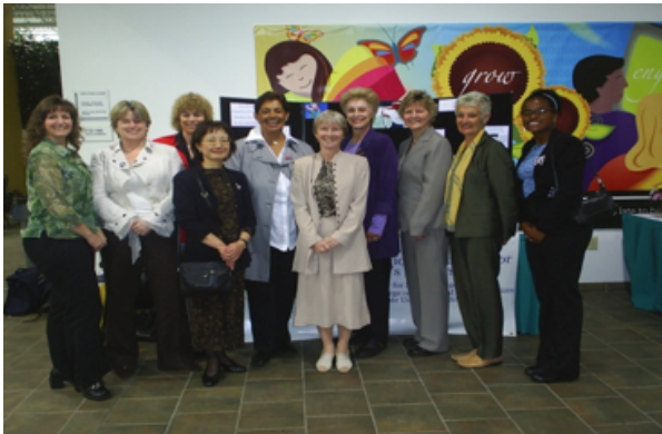
Left – Executive of IAPESGW in Stellenbosch at the 16th IAPESGW World Congres, 2009.