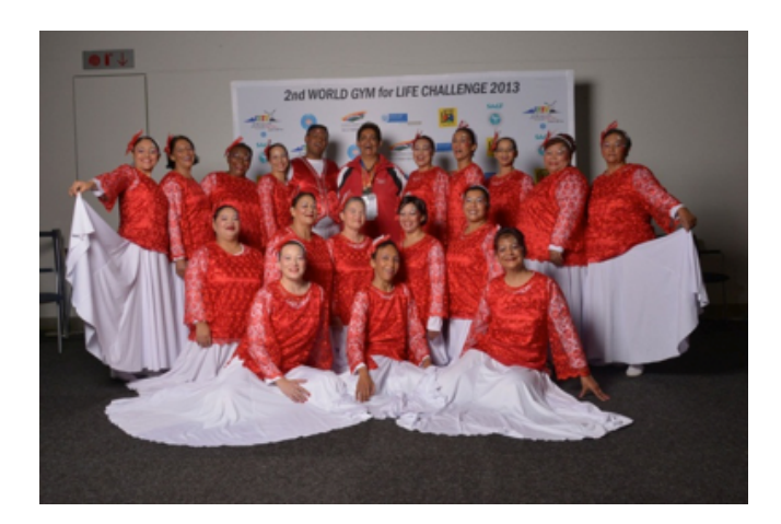
Above – This group of ladies [...] and one gentleman entered for the recent Gymn Fest held at the Cape Town International Conference Centre. "Great dancers are not great because of their technique; they are great because of their passion". The title of the dance which they performed: "Viva la Vida al Maximo".