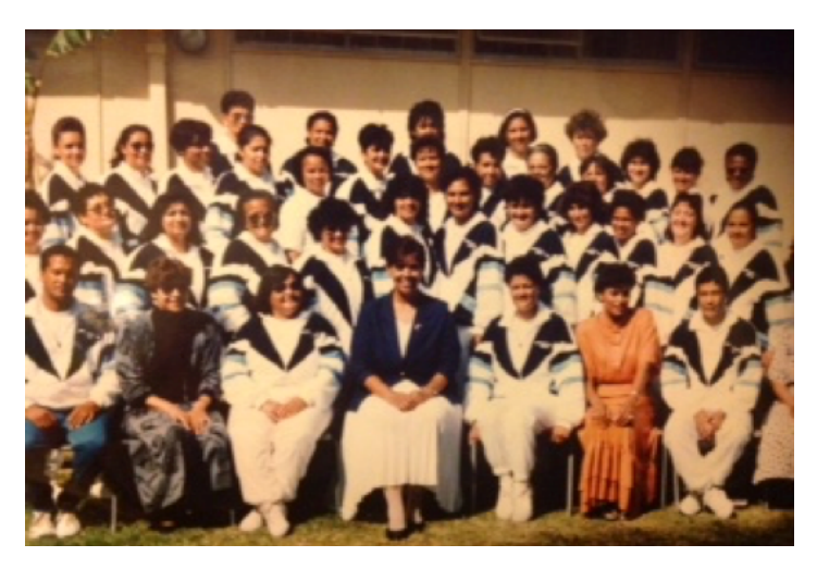
Members of the Western Cape Movement Education Association (WCMEA)

National Dance continued [...] Teachers were invited to attend National dance workshops. Interested Schools attended this programme on an extra-curricular basis. We also obtained permission from the Imperial Society of Teachers of Dancing (ISTD) in London to make use of some of the dances in their syllabus. There is a group of focused ladies that I trained and who obtained their Associate and Advanced examinations through the ISTD. They are choreographing their own dances and are responsible for training the teachers on the WCMEA programmes. These ladies to whom I've "passed the baton" are doing great work and am I very proud of them. They are still enthusiastic and eager to be part of this association.