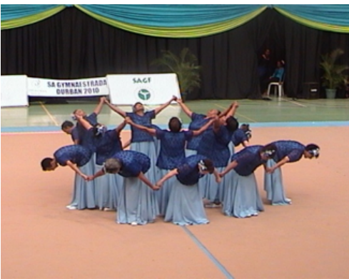
Left and Right – Opportunities for teachers to also participate at the Good Hope Centre in Cape Town and right performing at a Gymnaestrada in Durban ...and they loved it!!!