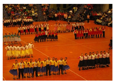
Left - Children performing a traditional "Riel" dance in Tulbagh.

Middle – Grade 1 pupils performing the Maypole dance in Mitchell's Plain.