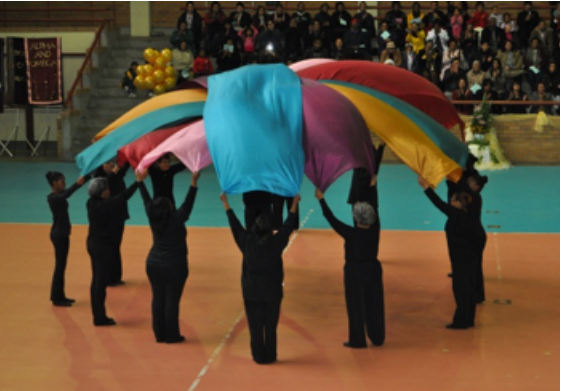
Above – The group of enthusiastic Wesleyan Christian Dance group from the Bellville South Methodist Church with whom I am working - going through their paces at two different Christian dance festivals in Cape Town.

I am currently busy with a part-time Quality Assurance programme of the Education Department and enjoy still visiting schools, but this time assessing all levels of school management.